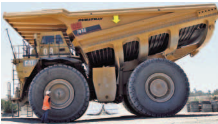
The Duratray SDB at work