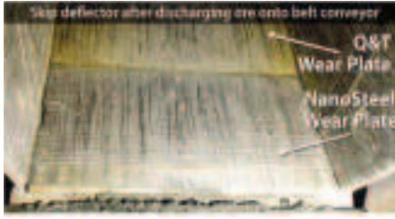
NanoSteel SHS 9800 overlay wear plate, 12.7 mm thickness, after deflecting over 400,000 t and exceeding Q&T plate life by 1.2 times

was removed from service for maintenance after deflecting more than 1 Mt of ore. This represents a service life increase of 2.9 times over 500 Brinell quench & temper (Q&T) monolithic wear plate, 15.9 mm thickness, and up to two times over chrome carbide (CrC) overlay wear plate, 15.9 mm thickness (half overlay and half substrate). Upon being placed back in service, mine engineers predicted that the NanoSteel SHS 9800 plate will exceed Q&T plate life by 4.3 times before requiring replacement.