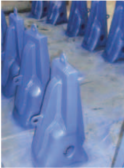
BluPoint uses Hardox 500 abrasion resistant steel, thickness 50/60 mm. The sheet, which can be shaped, allows good adaptation to different tooth geometries. Extreme strength and toughness are essential properties for the design

minimal since refurbishing time and any associated downtime only involve a matter of hours.