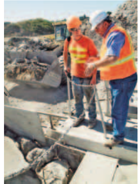
Columbia Steel's district managers and engineers begin by collecting real-world data on the equipment – feed and discharge information, throughput rates, change out records, and measurements on worn parts

improvements are available for virtually every popular jaw crusher. Among the jaw options are curved, smooth, and corrugated designs. More specialised recommendations for customers have included toothed jaws with smooth ends; concave/convex jaw